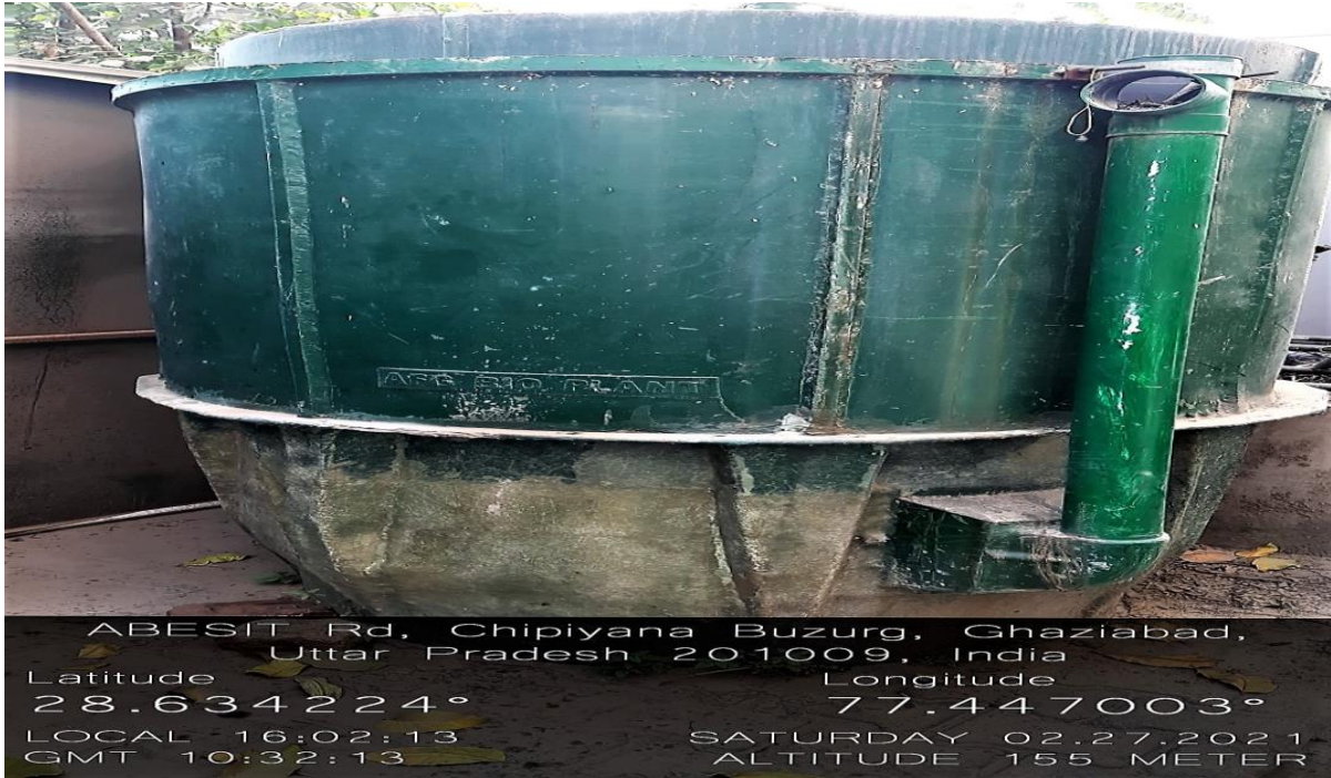
Digester Tank of Biogas Plant at Institute