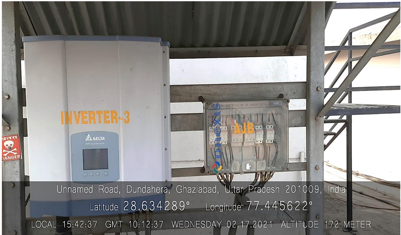
Solar Inverter and Array Junction Box at RAMAN BLOCK